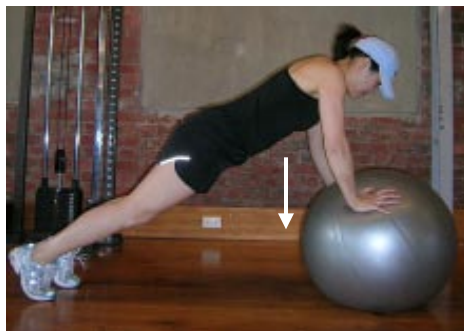
Hands on swiss ball

Press-ups using a swiss ball. You can either put your hands on a swiss ball or balance your shins on the swiss ball. Putting your hands on the swiss ball will work your stabilising muscles more while your shins will work your arms and chest more.